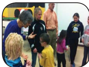
Art class activities